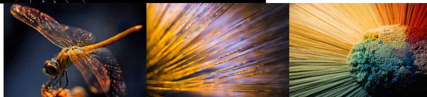
It's the crowning glory