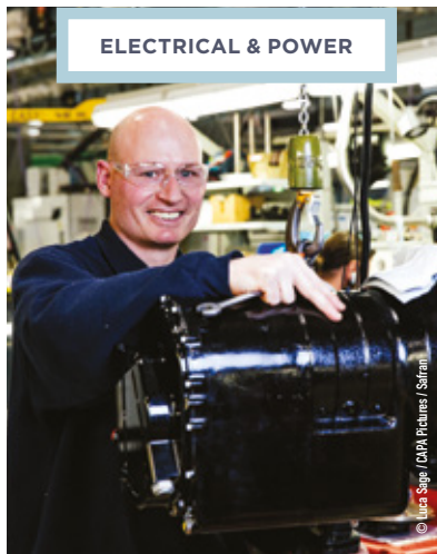
ELECTRICAL & POWER

4 repair centers in the world More than 18,000 nacelle units in service Over 115,000 flight hours per day