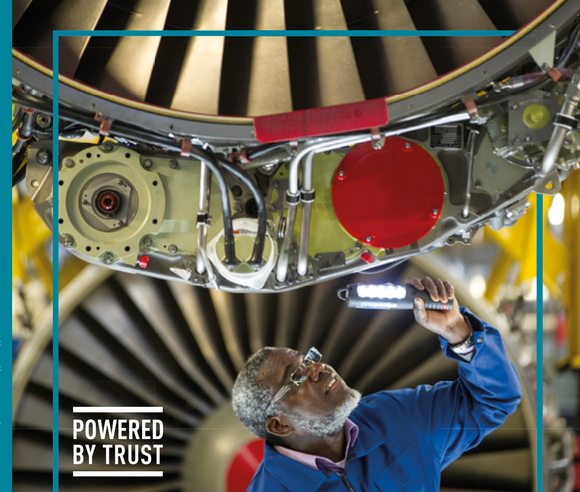
Corporate communications - Free-Lance's (Agence - November 2017 - Front cover's photo credit: Philippe Stroppa / Safran.