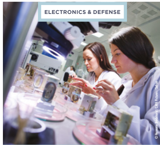
ELECTRONICS & DEFENSE

160,000 engine parts repaired annually 11 maintenance and repair centers for commercial engines in the world 90+ Field Service Engineers in 44 countries